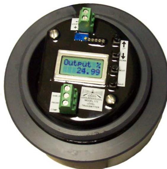
Mounted in a 4X PVC Housing with Cover Removed