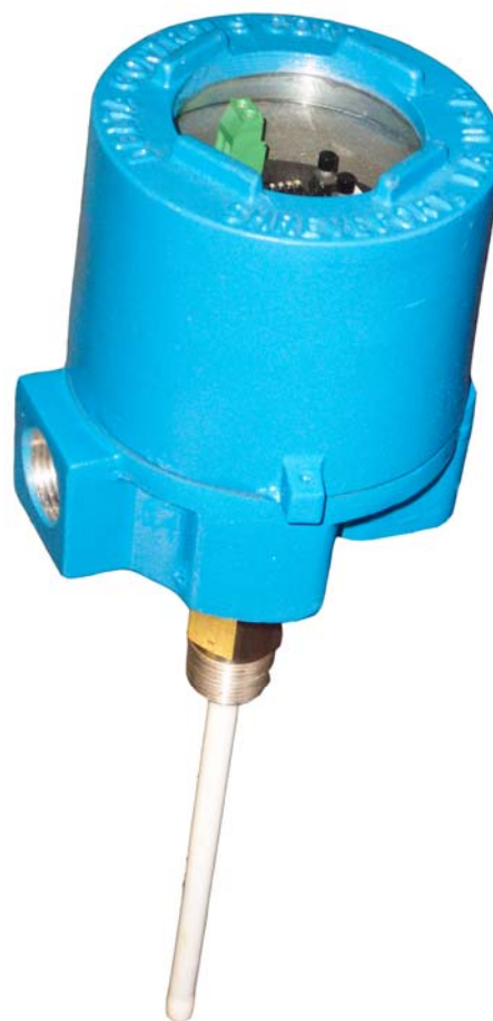
Mounted in an explosion-Proof Housing

It will correctly transmit the position of an interface by sensing the ratio of the admittance of the two liquids. Typical interfaces include oil/water, gasoline/acid, and foam/effluent. Interface control is important in crude oil separation, flotation mining, seed oil milling, and fuel tank sediment monitoring. The interface can be accurately detected even though it may be "cloudy" or be carrying a "rag layer."