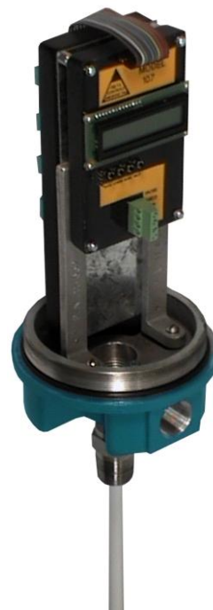
Model 107D Front View (Display, Pushbutton Controls and Probe Connections)

The Model 107 utilizes admittance technology to determine how much of the sensing probe is covered by the media. A radio frequency pulse is generated and travels from the sensing probe to the ground reference (normally the tank wall). The amount of liquid between the two determines how much energy is transferred. This energy (very small and low level in all cases) is a highly repeatable measure of the liquid level or interface position. The amount is compared to an internal reference and produces a switching action at the selected media levels.