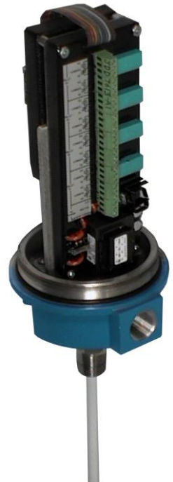
Model 107D Rear View (Relays and Power Connections)