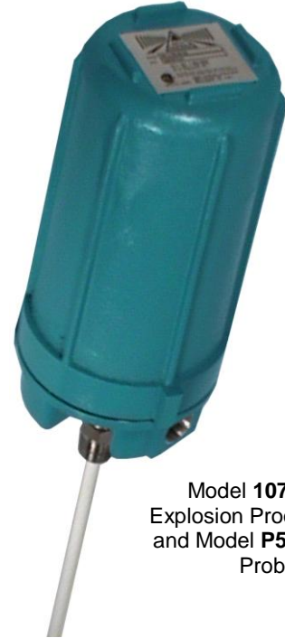
Model 107D with Explosion Proof Housing and Model P51 Sensing Probe